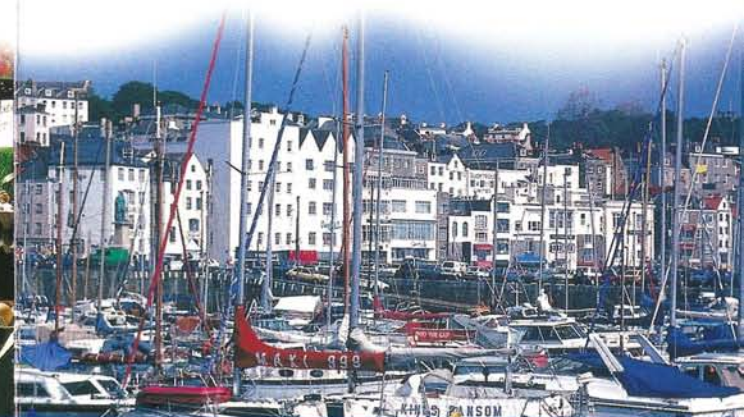
St Peter Port Harbour